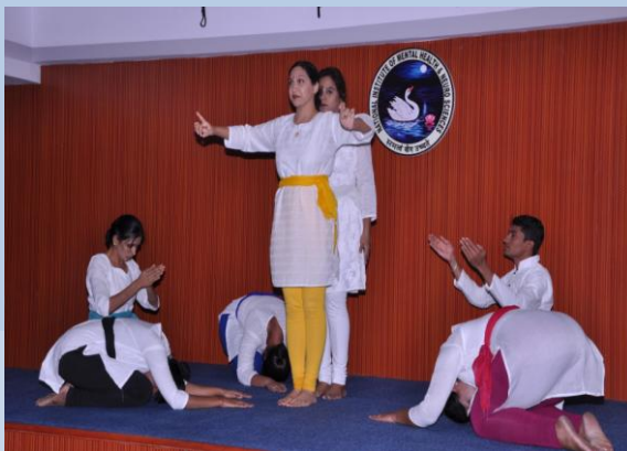
Yoga based ballet performance