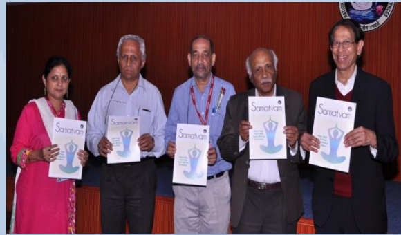
Dignitaries releasing Samatvam

The culmination was marked by performance of a yoga- based ballet by staff members from various departments of NIMHANS. The winners and participants of the yoga competition were felicitated by the chief guest and the Registrar, NIMHANS.