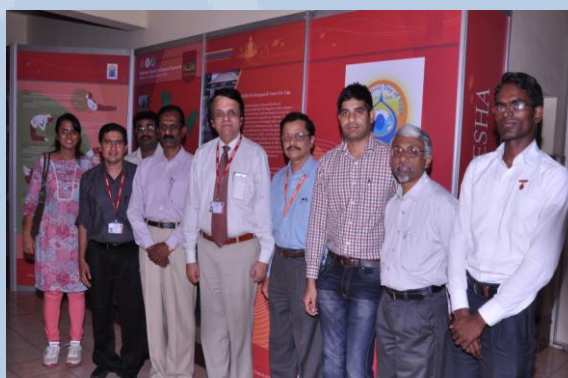
'Yoga Sandesha' at NIMHANS