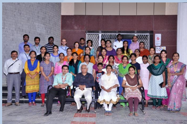
Participants of YAC, July 2015

The NIMHANS Integrated centre for Yoga conducts Yoga Appreciation Course (YAC) for the staff and students of NIMHANS from various disciplines. This course is conducted in the months of January, April, July and October. Duration of the course is one month. Both theory and practical classes are conducted by junior scientific officers and yoga instructors employed under NIMHANS Integrated Centre for Yoga. In the month of July 2015, the last