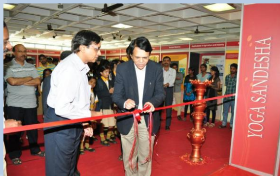
'Yoga Sandesha' at VITM