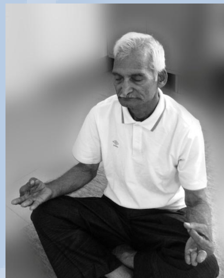
A senior citizen practicing yoga at NIMHANS Integrated Centre for Yoga

Feedback from a patient with Bipolar disorder